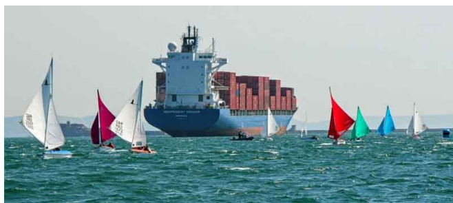
On the Run at the Chesil GP, WPNSA Portland